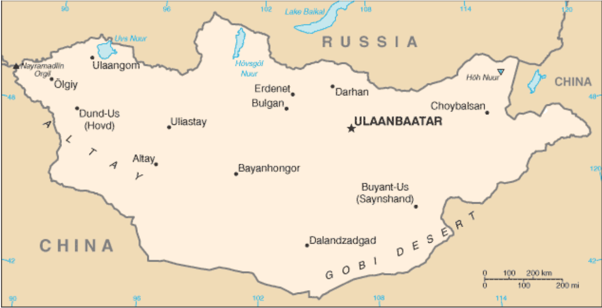
Uvs is located in the far north-west of Mongolia, its capital is the city of Ulaangom.